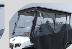
Optional All-Weather Enclosure