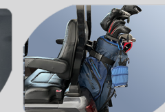
Optional Golf Bag Holder