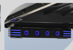
Cuboid Evolution Sound Bar