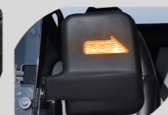
Powered Rear View Mirrors