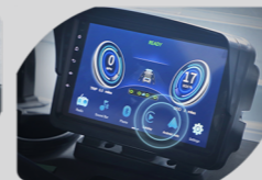
9" Touchscreen with Carplay Compatibility